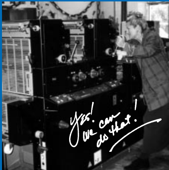
McCarthy Print • 1804 Chicon St. Suite 106 • Austin, Texas 78702 512.479.8938 • 512.494.8540 fax