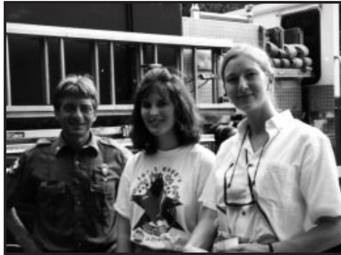
Even the grown-up neighbors loved the fire truck!