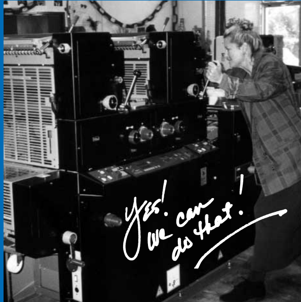
McCarthy Print • 1804 Chicon St. Suite 106 • Austin, Texas 78702 512.479.8938 • 512.494.8540 fax

Check mailing label for renewal information!