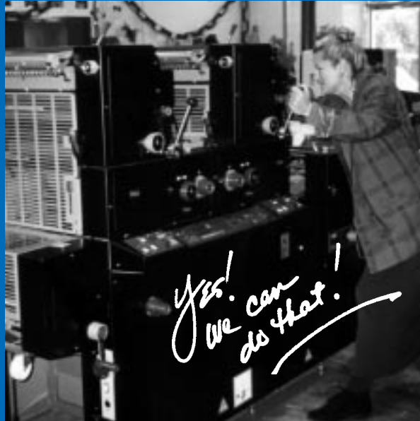
McCarthy Print • 1804 Chicon St. Suite 106 • Austin, Texas 78702 512.479.8938 • 512.494.8540 fax

Check mailing label for renewal information!